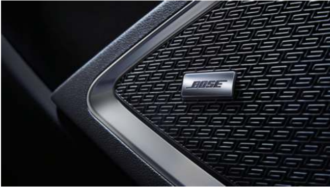
Sound system from Bose