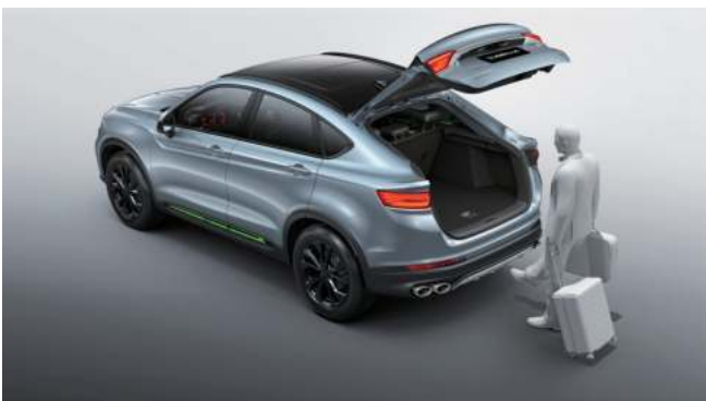
Power tailgate with hands-free function