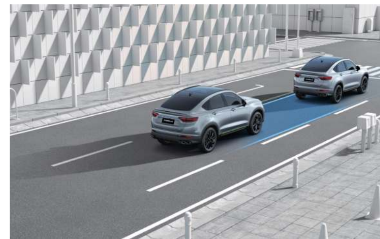
ACC (Adaptive cruise control)