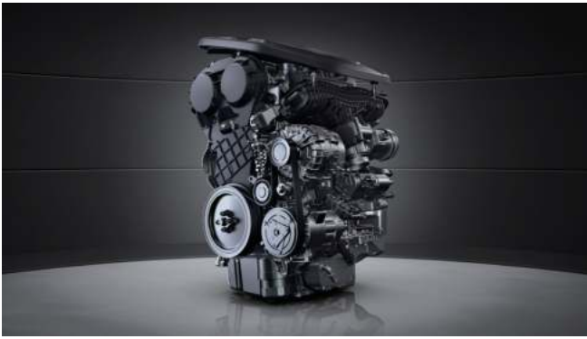
2.0TD+BAT high performance powertrain.