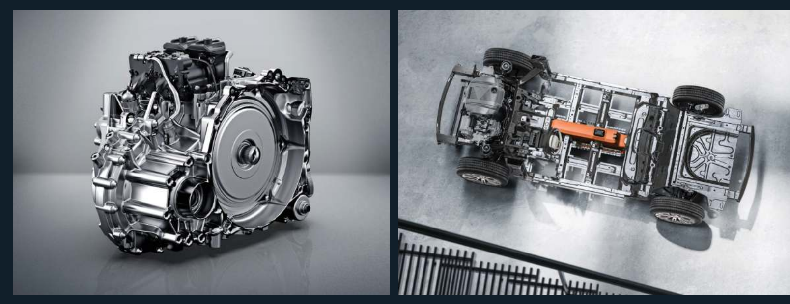
High-quality Aisin 8AT transmission featuring excellent energy-saving performance

In addition to CMA, 2.0TD engine and Aisin 8AT transmission, the Monjaro is also equipped with the latest BorgWarner Intelligent 4WD System (Sixth Generation).