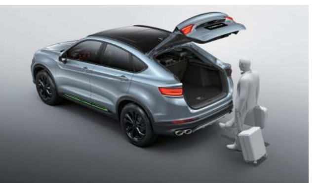
Power tailgate with hands-free function