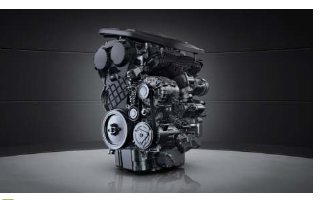
2.OTD+8AT high performance powertrain.