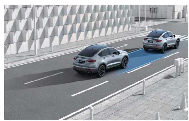
BSD (Blind Spot Detection)