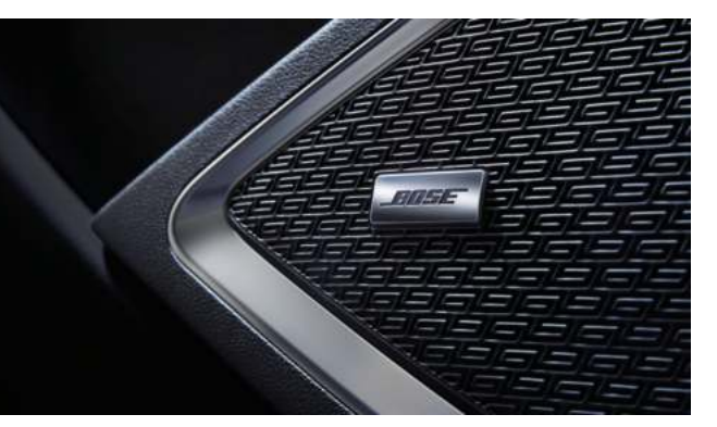
Sound system from Bose